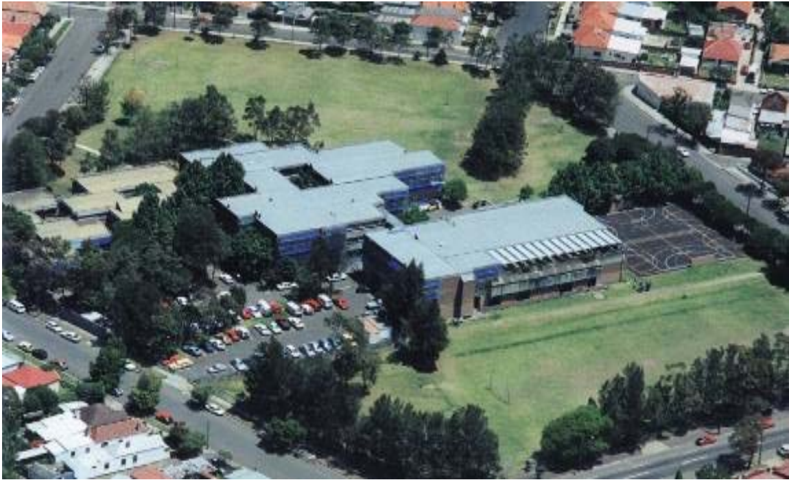
Tab A Proposed Reduction in the Designated Intake Area for Newtown High School of Performing Arts